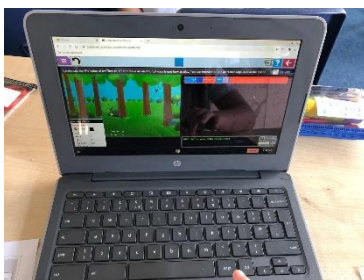
Coding in New Zealand