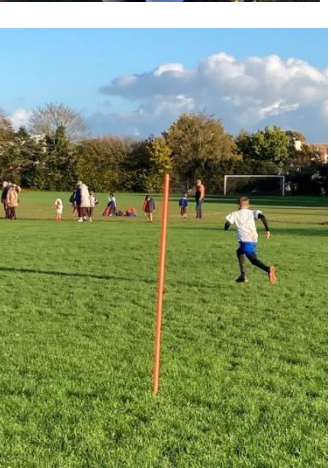
Reflection – (22) Hope - reflection - YouTube

Remembrance – We will be holding a 2-minute silence at 11am on Friday 11th November. If your child is part of a uniformed group, we invite them to come to school in their Cub, Rainbow, Beaver or Brownie uniforms. As we approach this commemoration, poppies and other Remembrance items will be on sale. The prefects will be selling these at break time, lunchtime and at the end of the day on the playground. We are asking for a contribution of about 50p for a poppy and a larger amount for the wristbands, badges, etc.