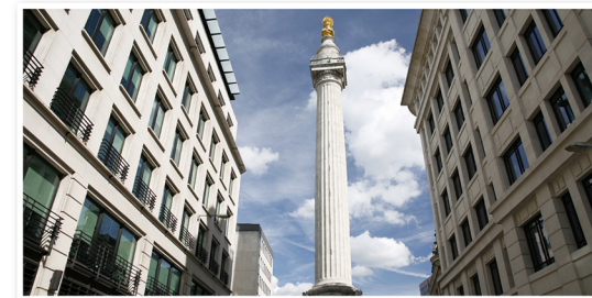
Monument to the Great Fire of London

The Great Fire of London was a significant event in London's history. It began in a bakery on Pudding Lane on Sunday 2nd September 1666. Many buildings were destroyed, including St Paul's Cathedral. Today, a monument stands near the place where the fire began.