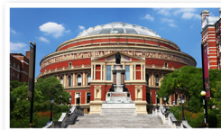
Royal Albert Hall