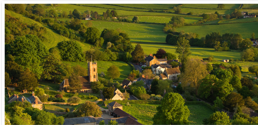
Village of Corton Denham, Somerset

The countryside is a rural area outside of a town or city. Less people live and work in the countryside than in a city.