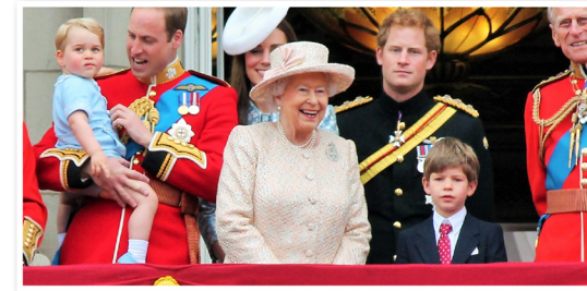
HM Queen Elizabeth II

Queen Elizabeth II is the current monarch of the United Kingdom. She was born in 1926 and became queen in 1952. The Queen is famous across the world.