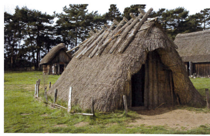
Recreation of an Anglo-Saxon house in Suffolk

After the invasion, people in the south and east of England settled into the Anglo-Saxon way of life. The Anglo-Saxons lived in small villages of huts and farmed the land. They were great craftspeople who used metal, wood, clay and precious stones to make weapons, tools, pottery, furniture and jewellery. When the Anglo-Saxons arrived in Britain, they were pagans, which means they believed in different gods. Over time, most Anglo-Saxons converted to Christianity. They spoke Old English, which developed from the language spoken by the Angles, Saxons and Jutes. Few people could read and write.