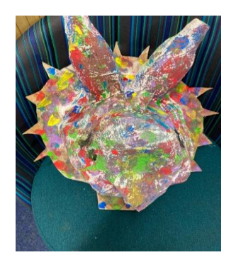
Class Assemblies Return - For children in the class and the parents during the summer term.

UK - Friday 24th June at 9am Austria - Thursday 16th June at 9am Thailand - Friday 10<sup>th</sup> June at 9am Italy - Friday 20<sup>th</sup> May at 9am India - Thursday 7<sup>th</sup> July at 9am New Zealand - Friday 1st July at 9am Ireland - Friday 15th July at 9am